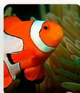
Clownfish REEF STAR