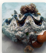
Giant clam TAKLOBO