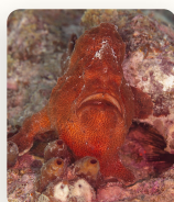
Frogfish MACRO TROPHY