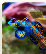
Mandarinfish DUSK DIVE