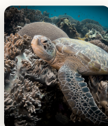
Green turtle PAWIKAN