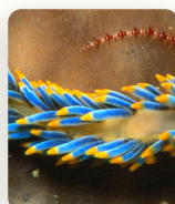
Nudibranch THE JEWELS