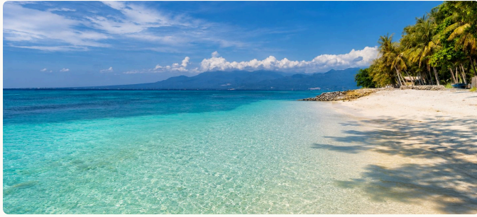
THE BEACH — YOUR CEREMONY