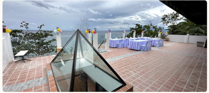
THE VILLA ROOFTOP — YOUR RECEPTION OVER THE SEA